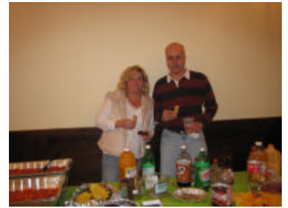
Happy to pose for a picture!