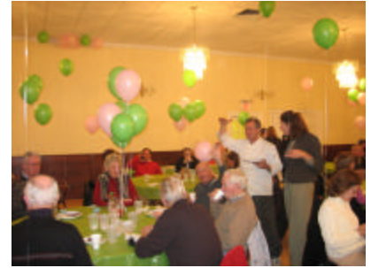
The Chef takes a break